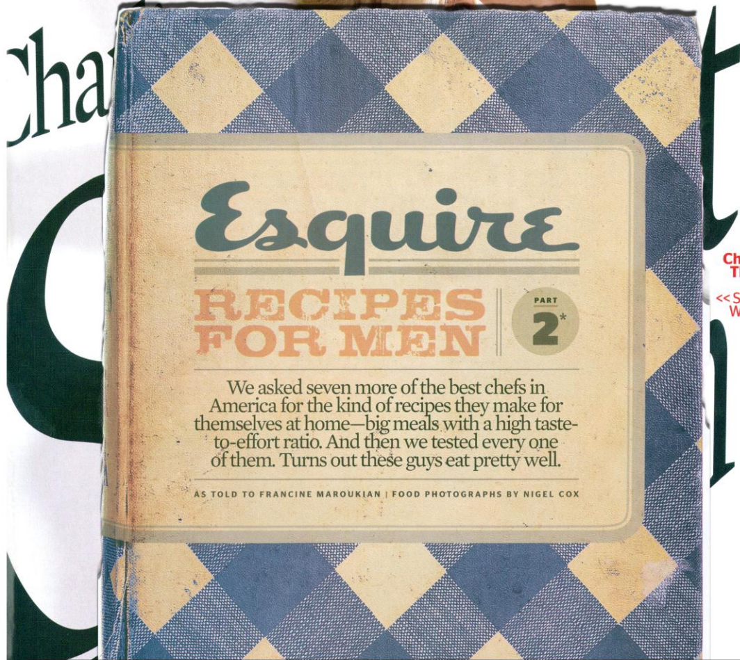
Charlize Theron Is the Sexiest Woman Alive

THE HURRIED MAN: Four courses in 26 minutes